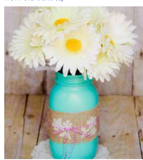
Stencilled Mason Jar Vase oopseydaisyblog.com/2012/04/stenciled-mason-jar-vase-for-mothers-day.html