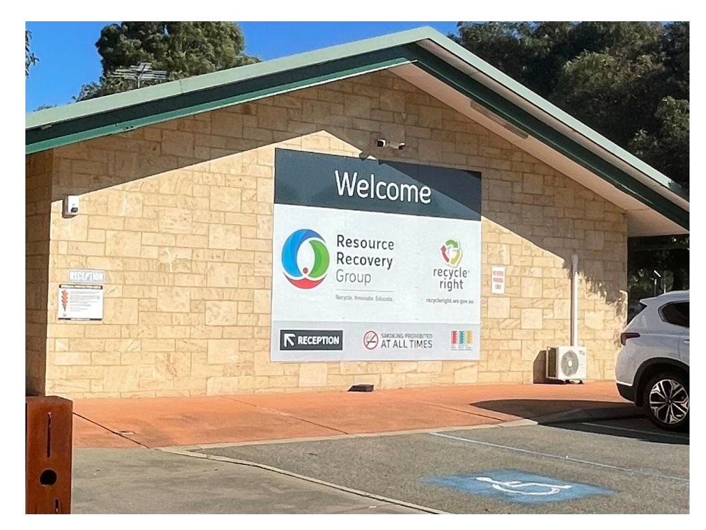
Find out more resourcerecoverygroup.com.au/

Educate by providing tools to recycle right, reduce waste and live more sustainably.