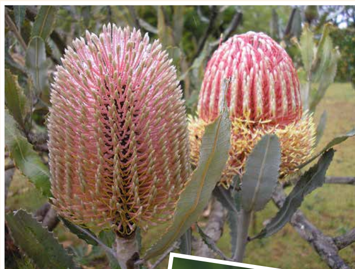
Photo: Banksia Menziesii