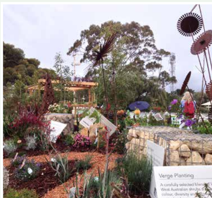
Photo: Last year's Greenfingers garden at the Royal Show