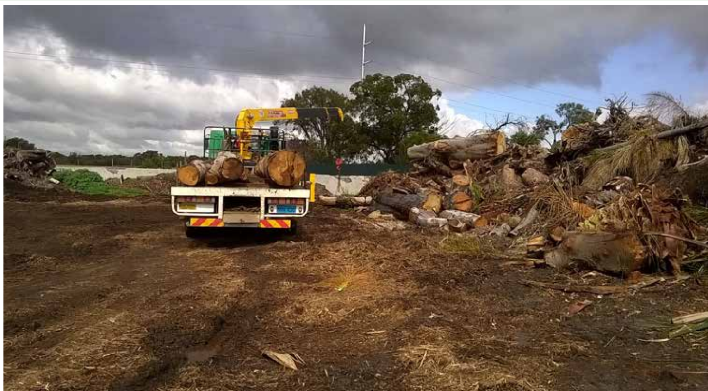
Photo: The logs being used in this year's Greenfingers Garden at the Royal Show