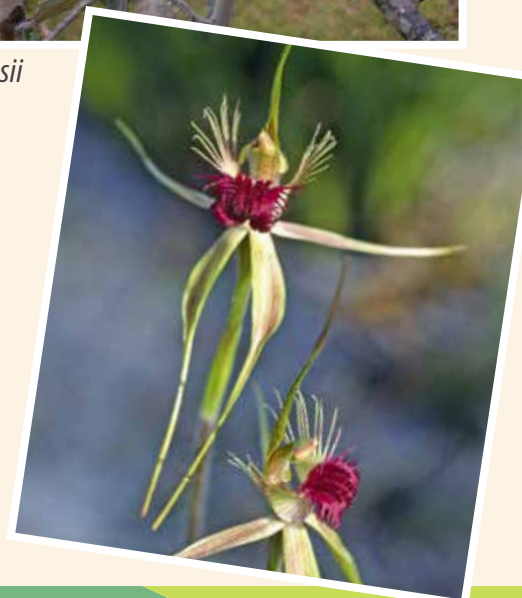
Photo: Caladenia Huegelii