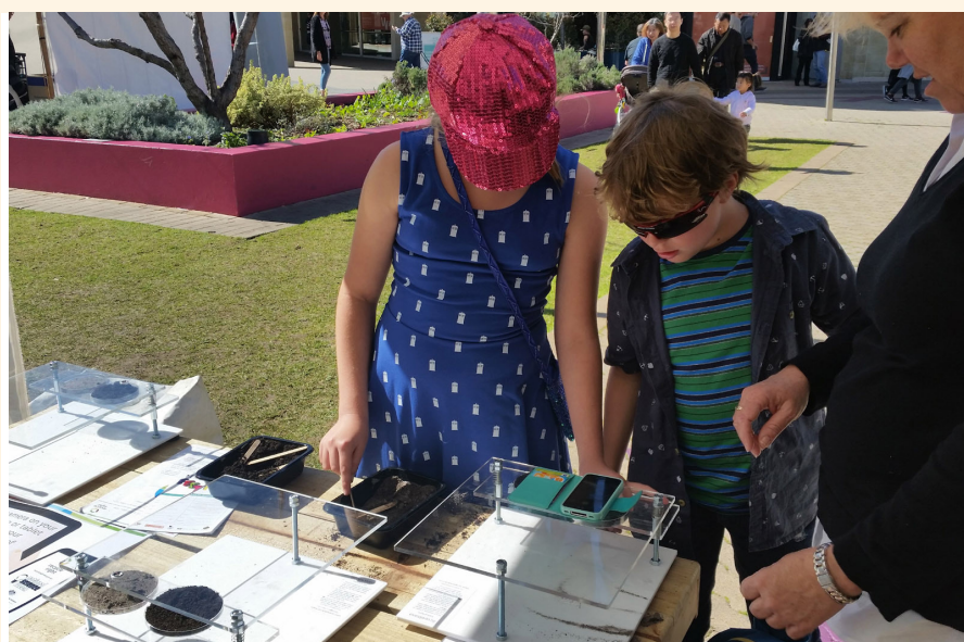
Photo: Getting a closer look at SMRC compost through the iScopes