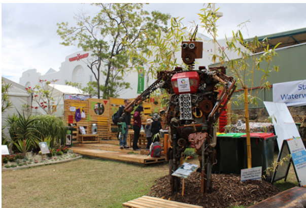
The Recycle Right Robot in Trevor Cochrane's Waterwise Garden

In addition to the display in the Waterwise Garden, the SMRC contributed at the 'Is plastic fantastic?' stand, a collaboration with the other metro regional councils to provide collaborative information about sustainability.