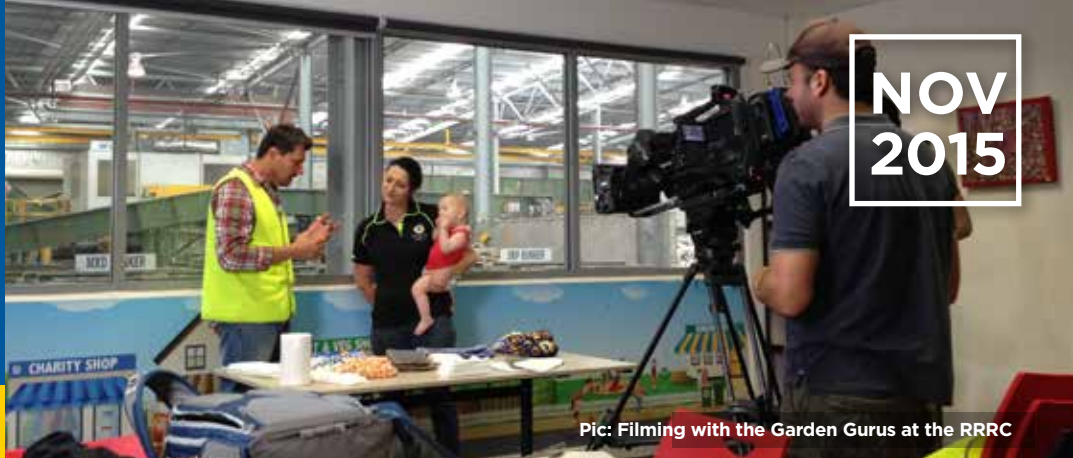
Pic: Filming with the Garden Gurus at the RRRC