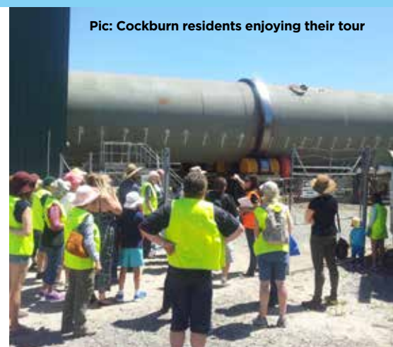
Pic: Cockburn residents enjoying their tour

All tour participants were thrilled with the tour and all the participants said they had learned a lot about how their waste was managed. They were going home to make some of those small changes that can make such a big difference to how their waste is processed, such as flattening their cardboard boxes and using a compostable bin liner or newspaper to line their bins.