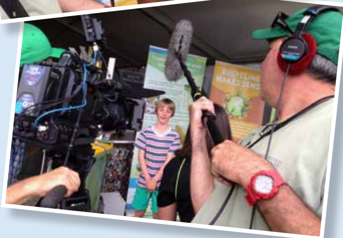
Photos: Filming the first episode of Greenfingers TV for 2014 at the Perth Royal Show