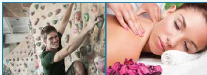
“Try giving the gift of an experience such as rock climbing or a massage”

Buy quality decorations and store them for future use.